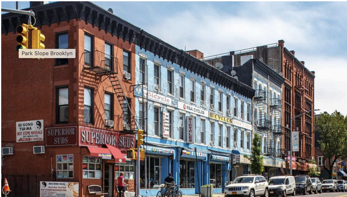
Park Slope Brooklyn